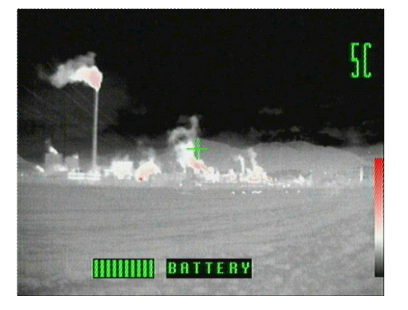
Fig. 1. TI of paper mill from locality number one.

75 Analysis of local climate in Ružomberok