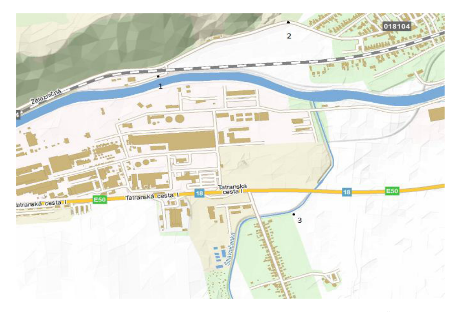
Fig. 1. Sampling sites in Lisková- numbers 1 and 2; and sampling site number 3 in the village Štiavnička.