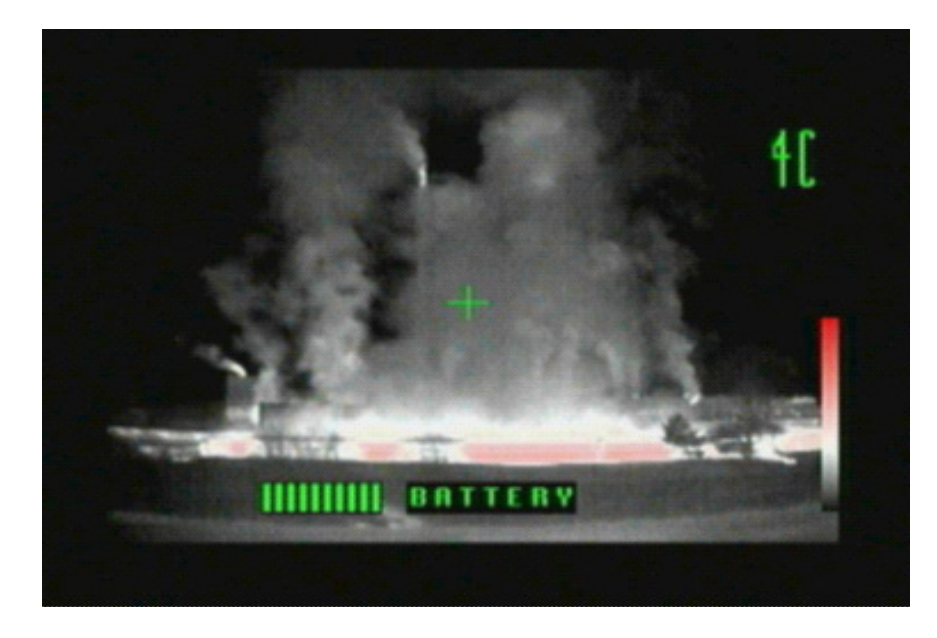
Fig. 2. Original sample of thermal Image of locality number 1. Different shades represent different radiation from the warmest to the coldest areas respectively.

Next we used the Blue to Red Pseudocolor function on this image. This enabled us to put the shade into five colours (red, yellow, green, cyan and blue). The red colour characterised backgrounds with the highest temperature, which occured clos-