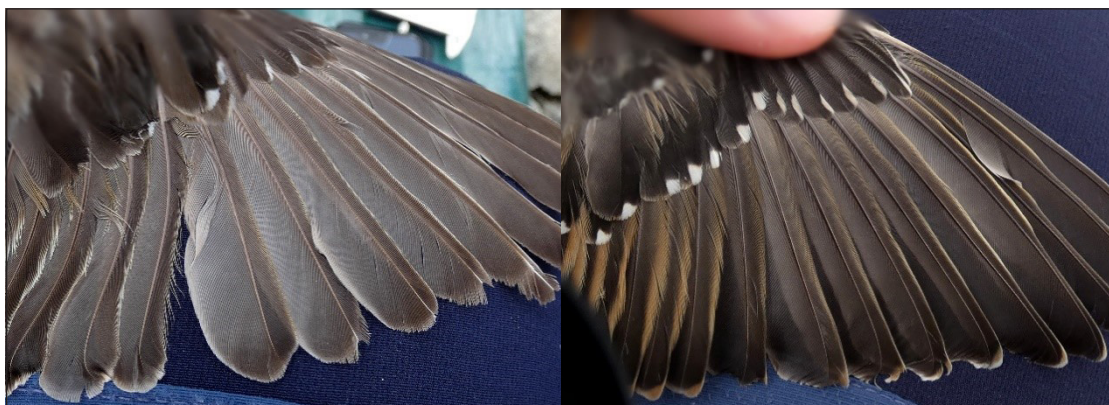
Fig. 2. Left: Alpine accentor, June 8 th , before moult, the plumage is worn. Note the abraded white tips on coverts and feather edges. Right: Alpine accentor, October 6 th , plumage fresh after having been moulted. The feathers have a sharper outline and a darker colour.

(Marčanová 2020). Newly coated feathers (Fig. 2) represent favourable food opportunity for the mites and also birds do not seem to remove them actively during the preening unlike parasitic lice (Blanco et al. 1997). Therefore, moult may be advantageous stage in mites' year cycle. Although, lice and mites share similar environmental conditions in the hosts feathers, they both must follow the annual pattern in moult of the Alpine accentor (Marčanová 2020), which has ecological impact on these parasites.