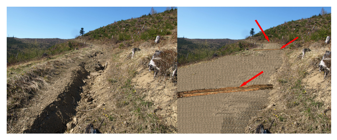
Fig.8. Working forest road - diverters, local slope correction (left – present state; April 20, 2011, photo: J. Slivinský, right - suggestion flood measures)

Vegetation revitalization and water retention