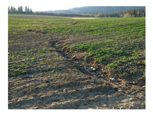
Fig. 4. Erosion groove resulting from surface runoff caused by waterlogged areas in the midfield (April 20, 2011)