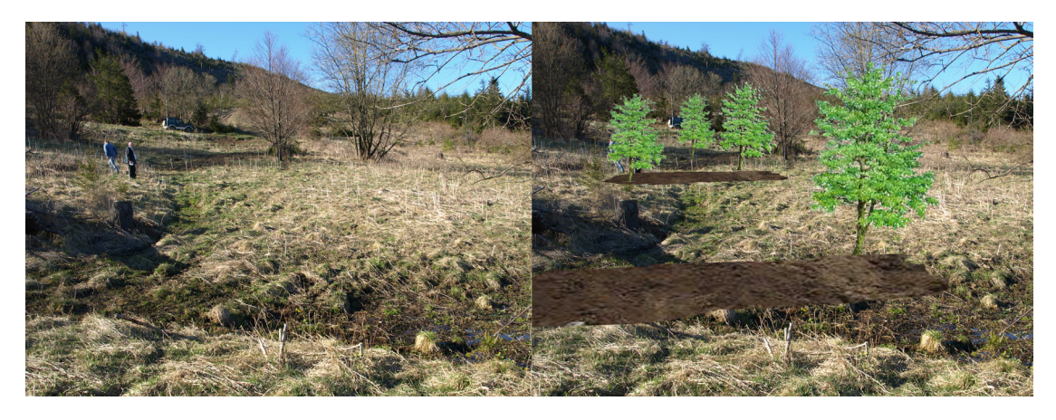
Fig. 10. The absoprtion ditch with retention area (left – present state April 20, 2011, photo: J. Slivinský, right - suggestion flood measures)