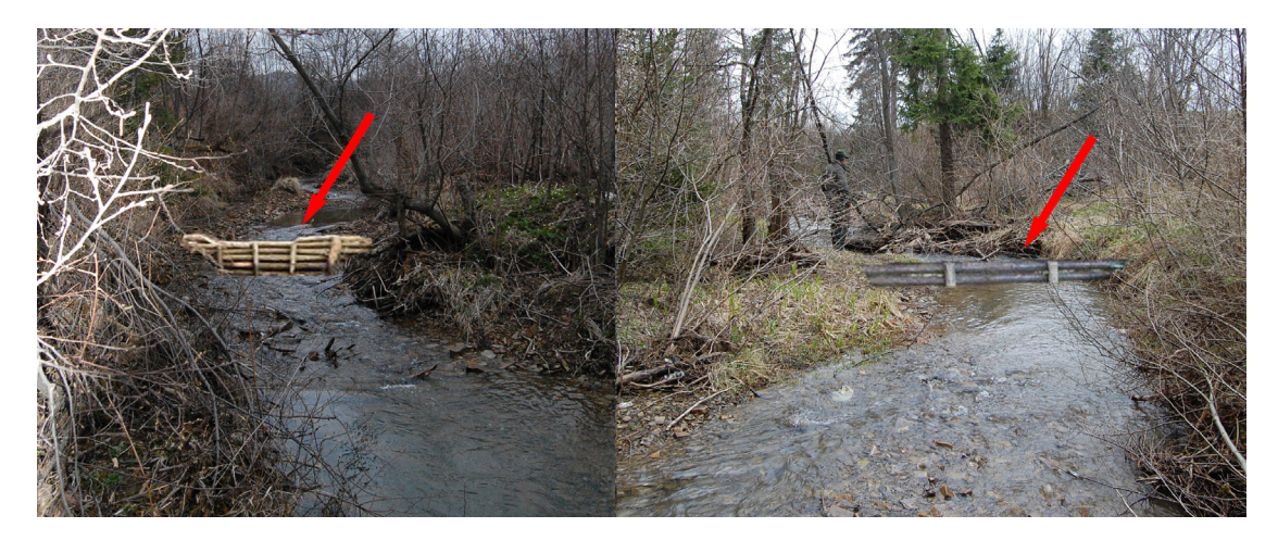
Fig. 9. Slovak creek (17 dikes) – sills, steps, dikes (April 15, 2011, photo: M. Janiga, simulation of waterholding measures)