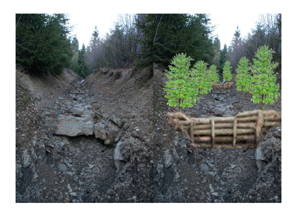
Fig. 7. The proposed model of water dikes in forest erosion groove (left - the current state; April 20, 2011, photo: J. Slivinský, right - suggestion flood measures)

forest road - Red - restoration - diverters, local slope correction