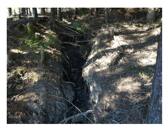
Fig. 3. Erosion ravine, depth of 1.5 m formed by accumulation of surface water runoff from several forest roads in the village of Slovenská Ves (April 20, 2011)