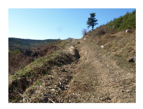
Fig. 2. Erosion groove caused by runoff (April 20, 2011,)