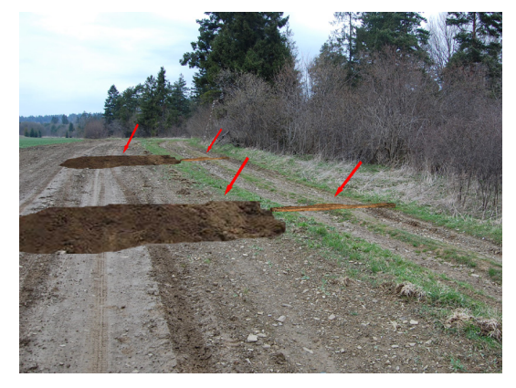
Fig. 11. The sloppy parts above the Jewish cemetery. Construction of waterholding measures on waterlogged farmland – dikes, tree planting (April 20, 2011).