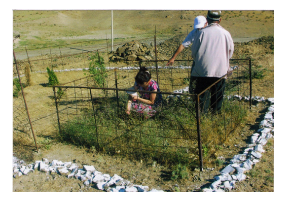
Fig. 2. Site no. 1 (60m^2) . Seedlings of local trees and shrubs inside the fenced area. Outside the fence there is a hole and stones prepared for sale.

Three basic plots for experimental works are shown on the map, located at 500 m, 300 m and 2,000 m from Ishmantup settlement. All three plots were protected by an iron fence, within which plants developed in protected conditions without intervention of livestock. The first plot 10 m long by 6 m wide (Fig.2).