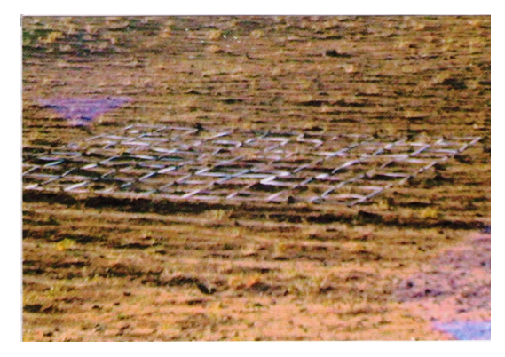
Fig. 3. White fences for measuring degradation of vegetation on slopes.

Due to the aridity of the climate, rangeland productivity is low. Geobotanists have estimated