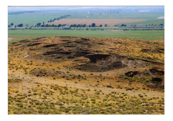
Fig. 4. Holes left after preparation of stones. In the foreground Phlomis thapsoides , in the background arable land.

The most serious impact on vegetation cover is that of cattle grazing. The negative influence of cattle on rangeland was found to increase