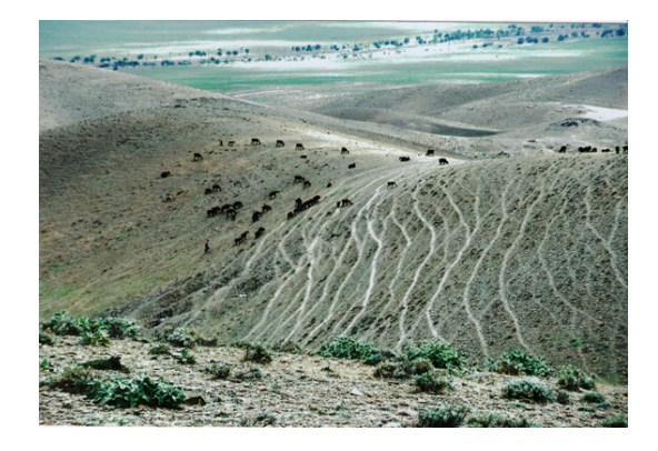
Fig. 6. Livestock trails on slopes.

If more than 50% of natural resources are lost nature can recover only very slowly and several decades are required to return to the previous state.