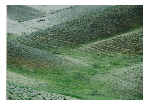
Fig. 5. Livestock trails on a slope. In the foreground large bushes of Phlomis thapsoides .

literature on the terminology of desertification. Due to the absence of precise criteria, desertification is often described as any deterioration of natural conditions of a given area. On the basis of an analysis of several studies devoted to the processes of desertification we have come to the conclusion that the exhaustion of at least 50% of the natural resources in a geosystem (onosystem) should be considered as the beginning of the process of desertification. This represents a breaking point beyond which the natural circulation of nutrients and energy in geosystems is strongly broken.