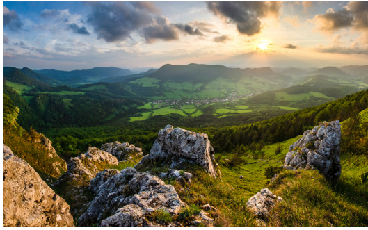
Fig. 1. View from the top of Vápeč hill. Ruderal habitats in the basins, beech-oak forests on steep slopes, xerotherm meadows on extreme sites, this is a typical landscape in Strážovské vrchy Mountains.

The most problematic is Epipactis neglecta Kämpel. Its taxonomy is perceived differently by different experts (Mereďa 2010; Delforge and Gévaudan 2002).